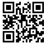
Homeowners Rehabilitation Program Application

Discover the positive impacts these initiatives have on our neighborhood's economic vibrancy and sustainable development. Apply today by scanning the QR codes or visiting our website at www.ChelseaEDC.org .